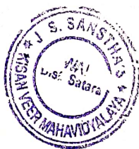
Head Department of Chemistry Kisan Veer Mahavidyalaya, Wai