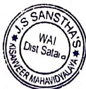
PRINCIPAL KISAN VEER MAHAVIDYALAYA Wai, Dist. Satara